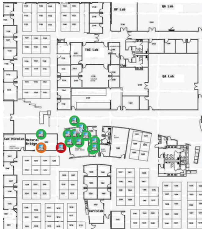
Figure 2. An unhealthy client

The floor plan in Figure 2 shows an unhealthy client (red), which ClientMatch will automatically steer to a better AP and radio to optimize overall performance.